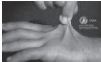
hyper elastic skin